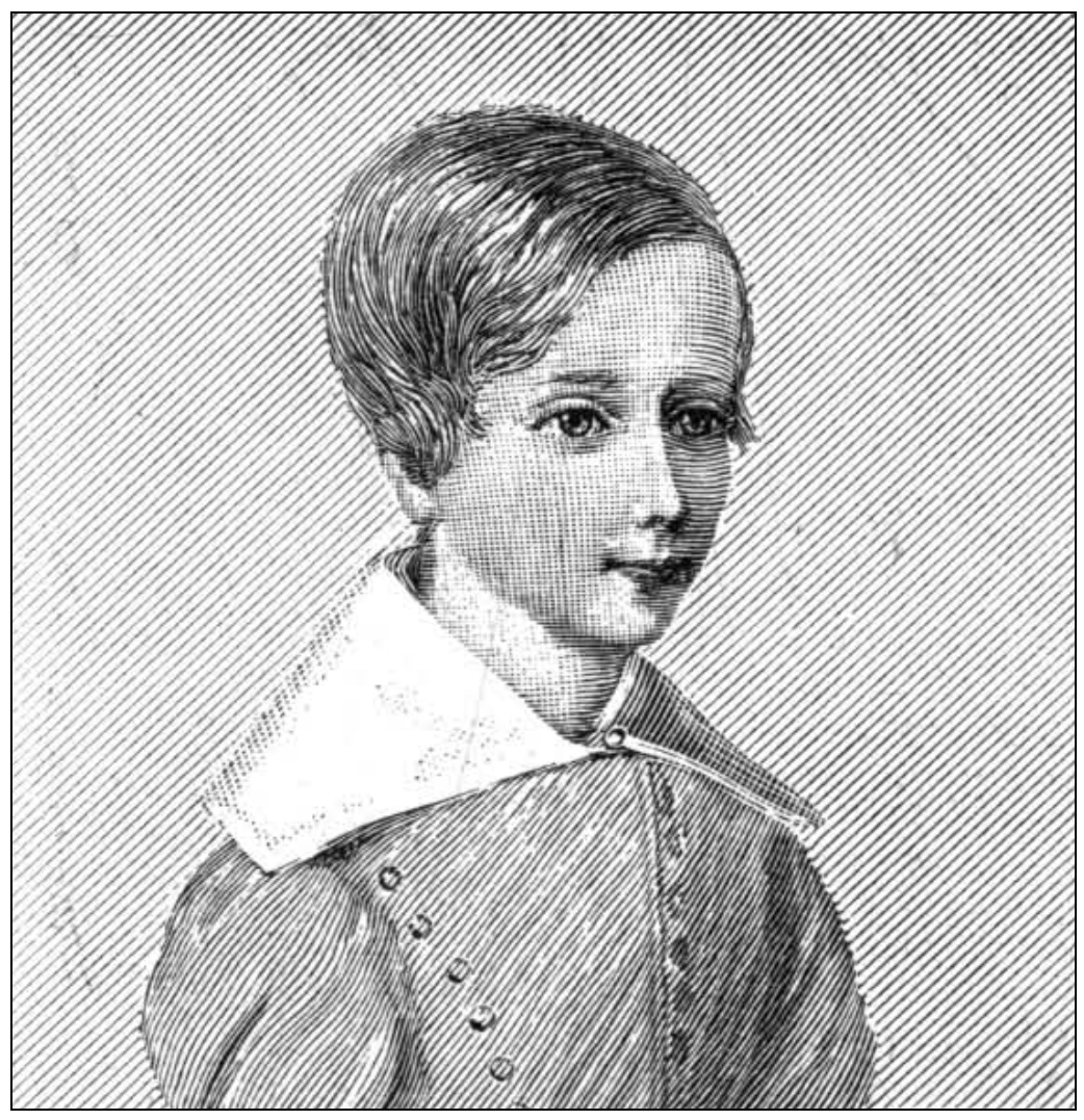
Baring-Gould at the age of five