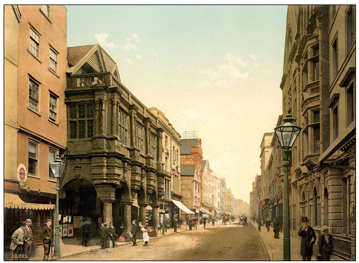
Exeter High Street, c. 1895 — Baring-Gould was born in St. Sidwell, a parish of Exeter, on 28 January 1834.